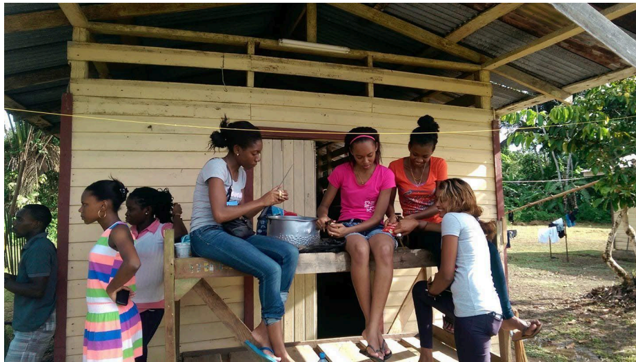
Youth Camp in Guyana