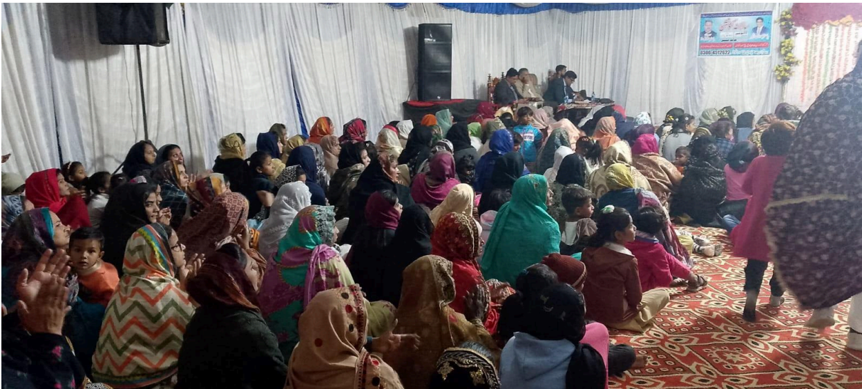
The People of Pakistan Worshiping