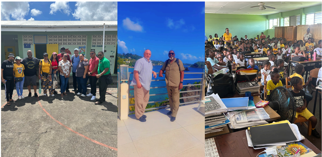
The FCIM 2025 St Vincent team