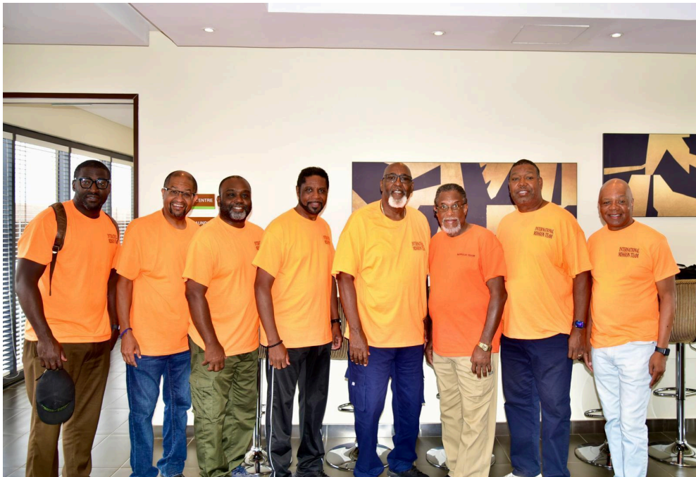
These Pastors were all serving with excellence in Uganda & Kenya July 2025