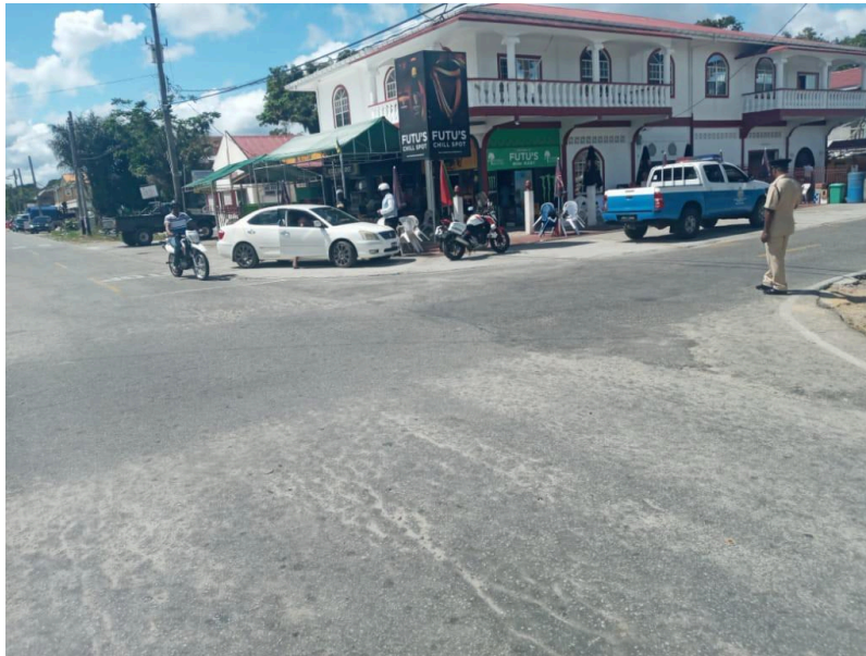
The Town of Bartica