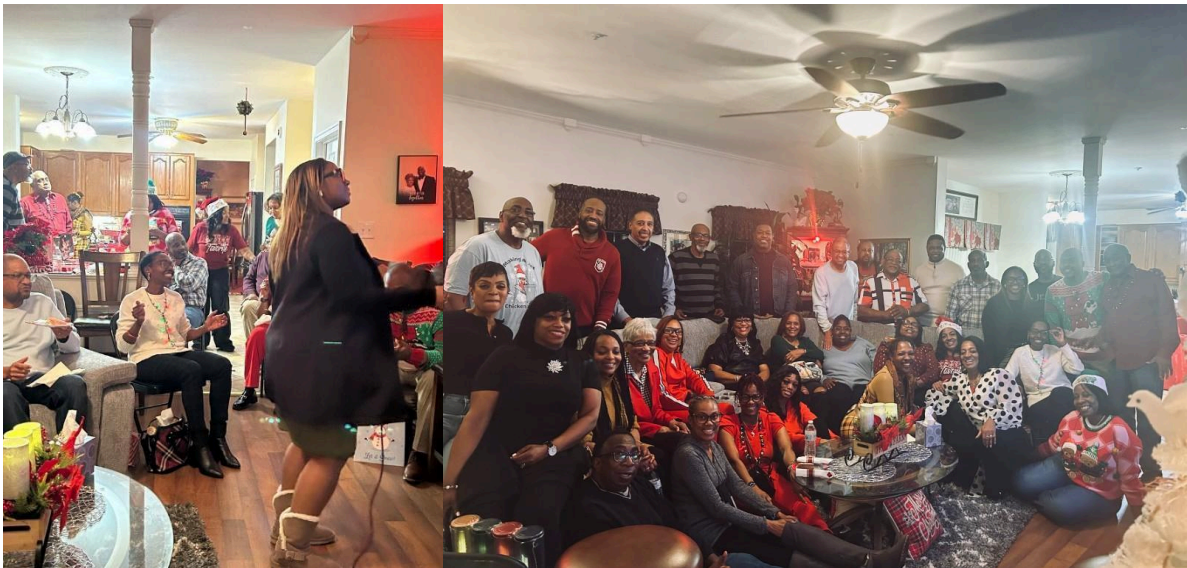
FCIM Christmas Party 2025