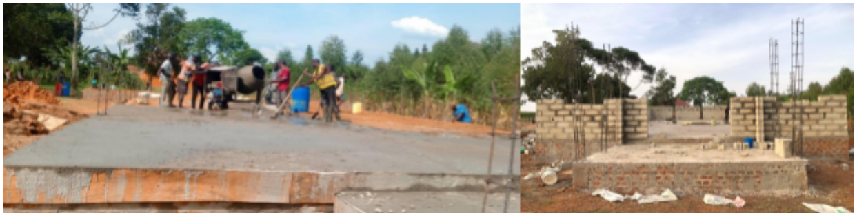
This Church in the process of being built in Uganda