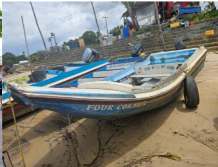
FCIM boat that needs restoration