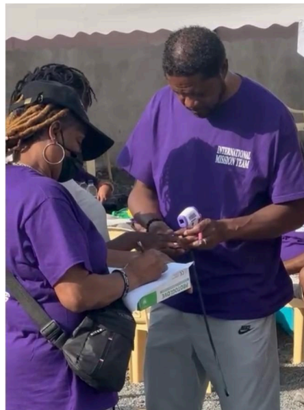
Loving God is loving people