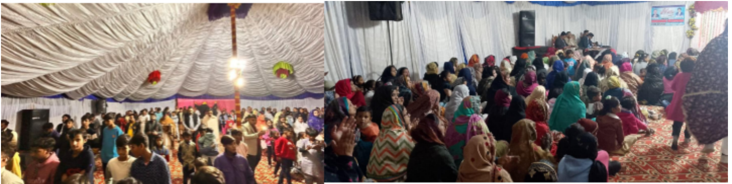
The People of Pakistan